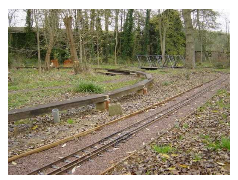
Northampton: track extension