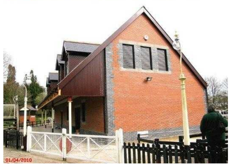
Cardiff MES, new station, before and after