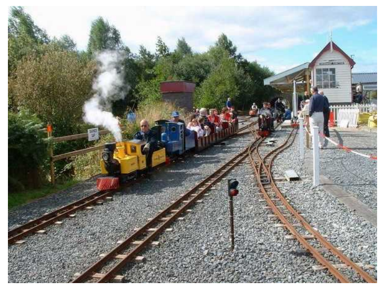
Bangor and County Down MRS: extension of track