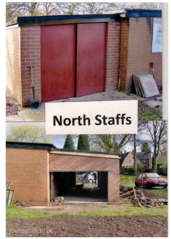
North Staffs MES, before and after