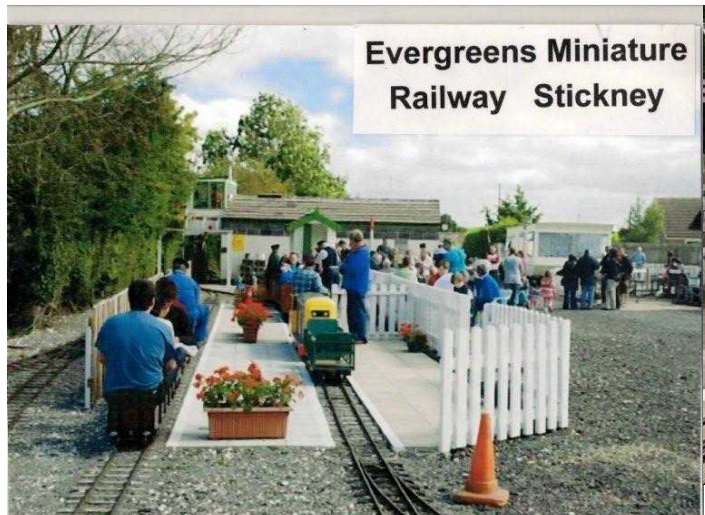
Evergreens: multiple projects