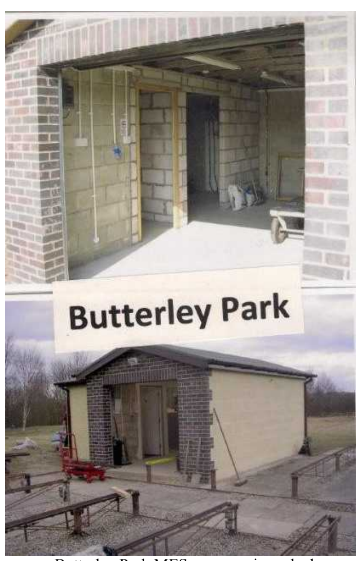
Butterley Park MES: new carriage shed