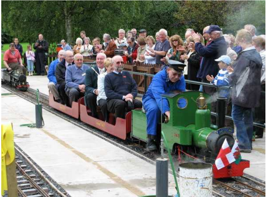
Leyland SME: inaugural run

Other aided projects, sorry, no pics: Erewash Valley, Echills Wood, Saffron Walden, and Stockport South