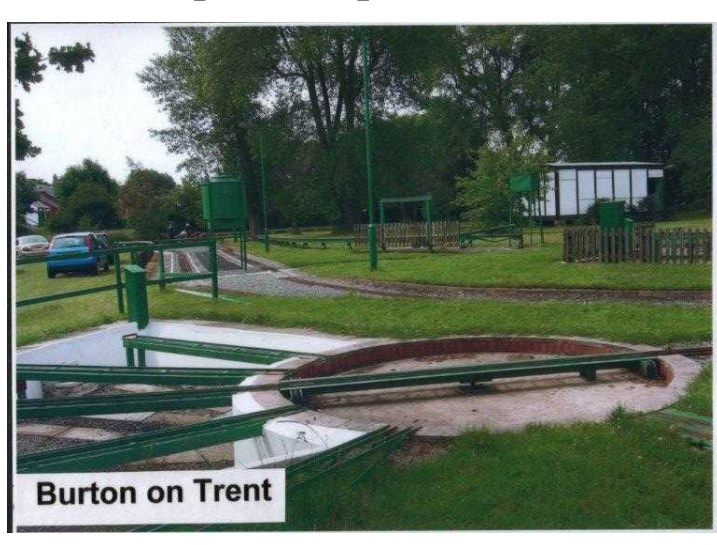
Burton on Trent MES: new steaming bays